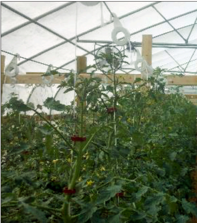
Figure 8. Tomato plants are grown vertically on strings suspended from a cable trellis. The string is wrapped around a spool that attaches to the trellis. Once the tomato reaches the cable some of the string is released from the spool. This lowers the plant and the spool is then slid down the cable trellis.

is wrapped around a spool that attaches to the trellis. Once the tomato reaches the cable, some of the string is released from the spool. This lowers the plant and the spool is then slid down the cable trellis (Fig. 8). This technique is called “leaning.” Plants can eventually reach lengths of more than 15 feet (4.6 m), but only about 6 to 8 feet (1.8 to 2.4 m) are vertical at any given time; most of the plant runs horizontally above the ground.