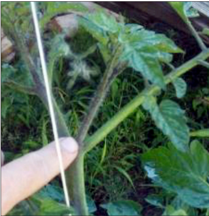
Figure 7. Greenhouse tomatoes are trained to a central vine by removing all lateral growth (suckers) at least once weekly throughout the life of the crop.