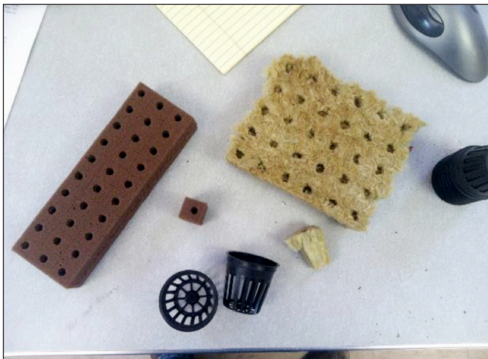
Figure 4. Two- to 3-week-old seedlings are commonly used as transplants. The transplants are grown in either a foam media cube or a net pot filled with soilless substrate.

With both systems the cropping culture details will be almost identical. Two- to 3-week-old seedlings are commonly used as transplants. The transplants will have been grown in either a foam media cube or a net pot filled with soilless substrate (Fig. 4). Most commercial growers currently use foam media. Transplants are placed directly into the DWC or NFT system. DWC systems offer more flexibility in plant spacing and can use 4-, 6-, or 8-inch (10-, 15-, or 20-cm) centers. A 4 foot × 8 foot (1.2 m × 2.4 m) raft could have 48 to 88 plant sites depending on the desired final market size. Most NFT channels have holes cut on 7- to 8-inch (18- to 20-cm) centers, although custom channels are available. The higher the plant density, the smaller the plants and greater the input costs (labor, seeds, and media) per unit. A common plant density using 8-inch centers would be 2.25 plants per square foot (24.2 plants/m 2 ).