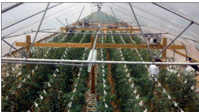
Figure 5. Trellis systems are often constructed with two cables per plant row. Cables are positioned above the rows and are spaced 24 to 30 inches (61 to 76 cm) apart. Between-row spacing will vary depending on the crop.

ing on the crop. A 30-foot-wide (9-m-wide) greenhouse can accommodate five double rows of trellised vine crops (Fig. 5).