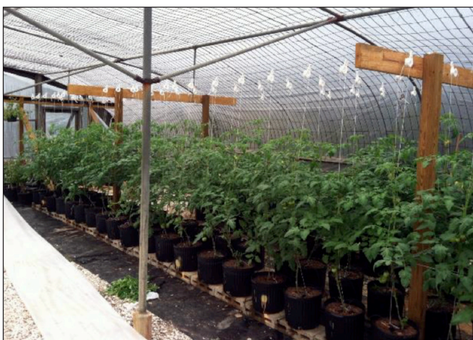
Figure 6. Unless the greenhouse is specifically designed for the trellis, do not use the greenhouse end wall to support the trellis cables. The weight of the crop has been known to severely damage greenhouse walls. Trellises can be supported with steel pipes or large pieces of lumber.

Unless the greenhouse is specifically designed for the trellis, the greenhouse end wall should not be used to support the trellis cables. The weight of the crop has been known to severely damage greenhouse walls. Trellises can be supported with steel pipes or large pieces of lumber (Fig. 6). Trellis cables are typically positioned at the same height as the greenhouse gutters or eaves, which in some commercial greenhouses can be as high as 20 feet (6 m). In these high ceiling greenhouses, movable scaffolding is required to train and harvest crops. Small growers in the Southeast often have a trellis height of 7 to 8 feet (2.4 m). A trellis system can be constructed for less than $2,000 for a standard 30 foot \times 96 foot (9 m \times 29 m) greenhouse.