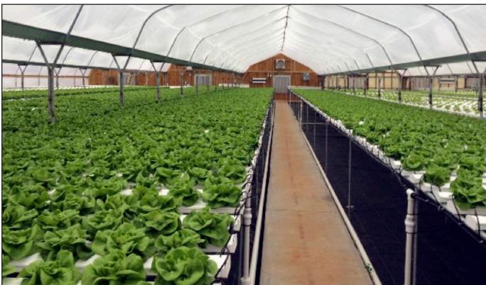
Figure 2. Nutrient Film Technique (NFT) systems are a series of plastic channels through which a thin film of nutrient solution is constantly recirculated.

Nutrient Film Technique (NFT) systems use a series of plastic channels through which a thin film of nutrient solution is constantly recirculated. The plastic channels usually measure 4 inches wide (10 cm) and 6 to 12 feet long (1.8 to 3.6 m; Fig. 2). Transplants are placed in holes cut in the tops