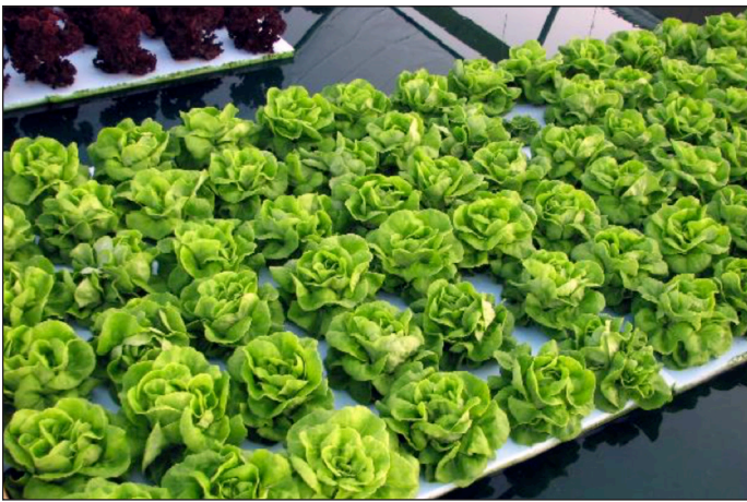
Figure 1. This lettuce is growing on rafts floating on a nutrient solution into which the roots grow.

× 2.4 m) polystyrene sheets with thicknesses of 0.75 to 1.5 inch (1.9 to 3.8 cm). Growers may decide to cut the board into sections for easier handling and to prevent rafts from cracking when being moved. Water depth in raft systems can range from 6 to 12 inches (15 to 30 cm). Tank walls can be made from treated lumber or concrete blocks and then a plastic liner is laid down within the walls to retain the nutrient solution.