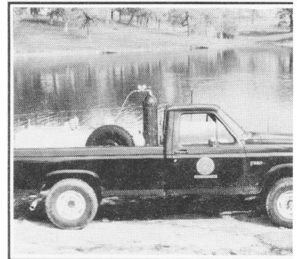
Pickup and tank equipped with oxygen used for fingerling delivery.

More information is needed on optimum hauling temperatures and salinities for different sizes of red drum at various loading densities. Acclimation rates for different conditions also need further evaluation.