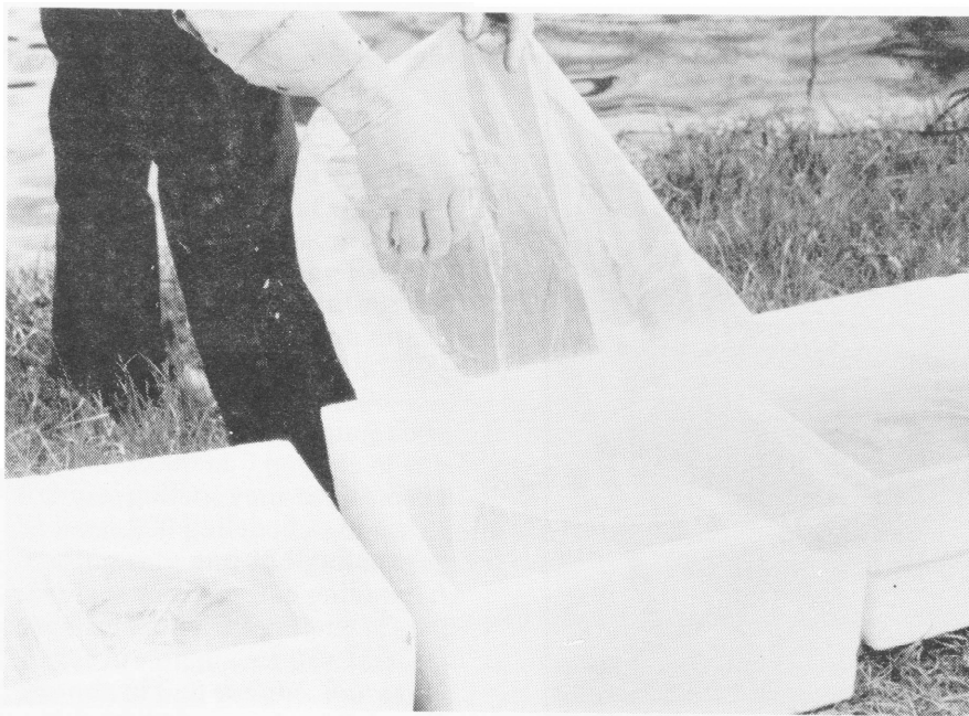
Figure 1. These are typical plastic bags and styrofoam boxes used for transporting small fish. Water temperature must be adjusted before adding fish, and oxygen must be added before transporting.

Table 3 provides guidelines for transporting bluegill at temperatures between 65° and 80° F and up to 16 hours. Bluegill are normally hauled with 0.3 to 0.5 percent salt.